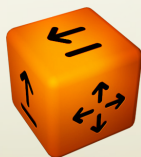
Movement Die Results