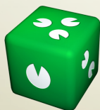
Action Die Results